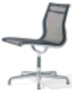
Eames Aluminum Group Side Chair with Cygnus Mesh