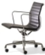
Eames Aluminum Group Management Chair