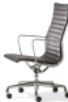
Eames Aluminum Group Executive Chair