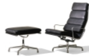
Eames Soft Pad Lounge Chair and Ottoman