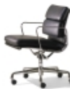
Eames Soft Pad Management Chair