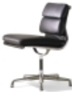
Eames Soft Pad Side Chair