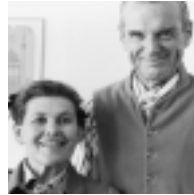
Charles and Ray Eames

All chairs feature five-star, die-cast aluminum bases.