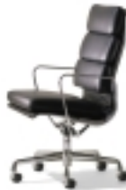
Eames Soft Pad Executive Chair