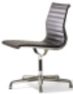
Eames Aluminum Group Side Chair