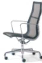
Eames Aluminum Group Executive Chair with Cygnus Mesh