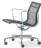
Eames Aluminum Group Management Chair with Cygnus Mesh