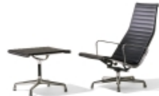
Eames Aluminum Group Lounge Chair and Ottoman